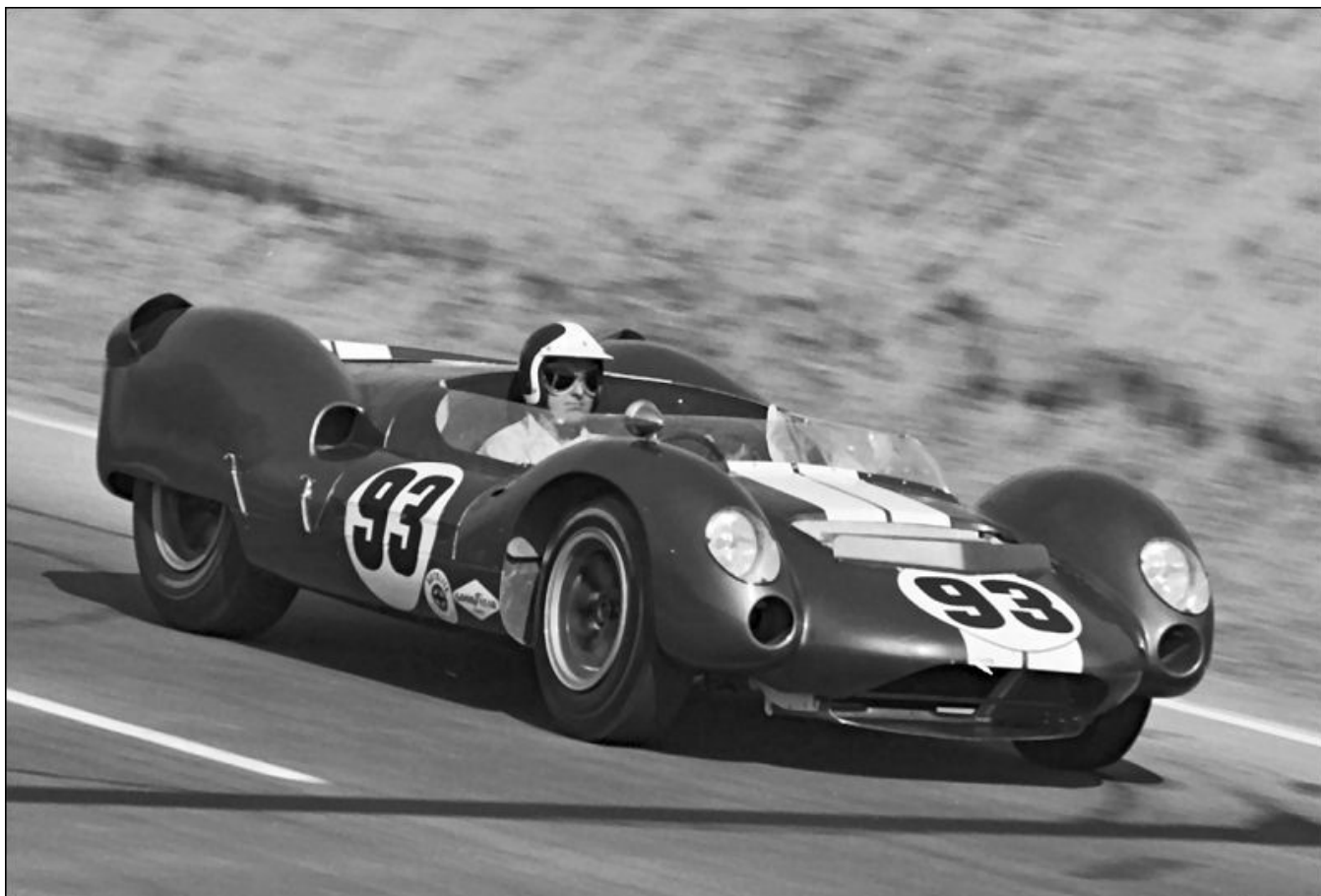
1964 LA Times GP, Riverside - Bob Bondurant