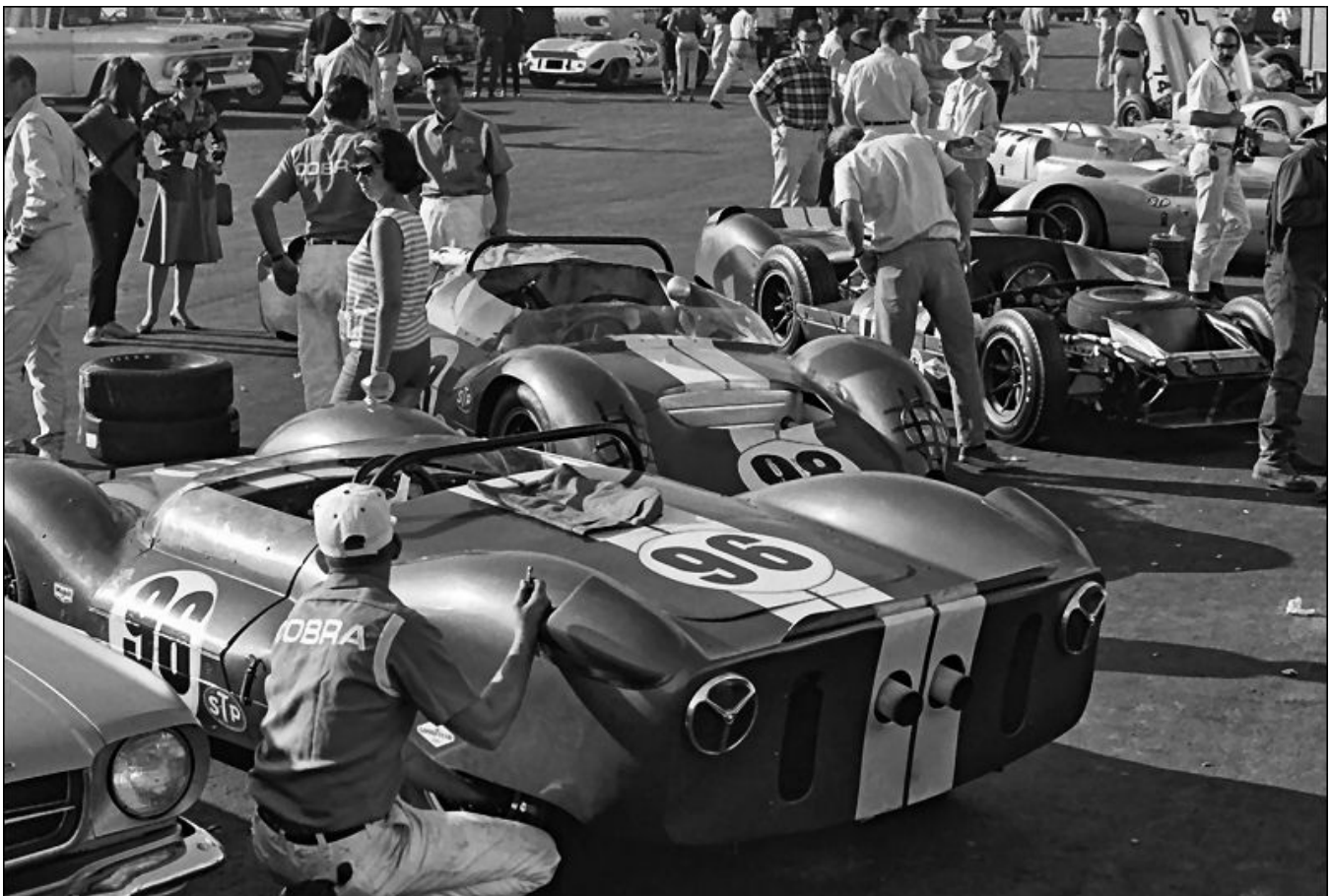
Below: All three King Cobras together at Laguna Seca in October 1964 for the Monterey GP with CM/5/64 nearest the camera.