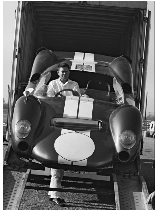
Above: CM/5/64 being unloaded at Riverside in 1964.

In 2015 CM/5/64 was sold to the current owner, a classic car enthusiast, collector and historic racer who is big on history, accuracy and authenticity as well as a cars potential to reach antiquity status. To this effect, the King Cobra has been restored with the correct '64 spec Brock styled bodywork which was fabricated using a quarter scale wooden model made by Peter Brock himself specifically for this project. The restoration was done to the most exacting standards and was completed in June 2020.