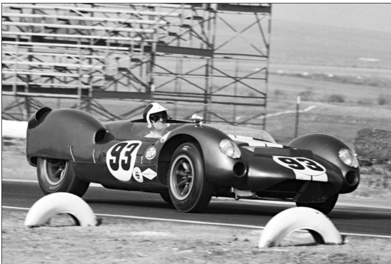
11/10/64: LA Times GP, Riverside - B.Bondurant - 5th