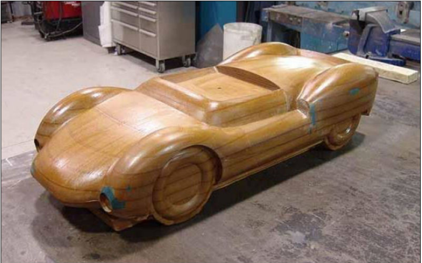
Peter Brock's 1/4 scale wooden model of the King Cobra

I was fortunate to be able to work with Peter Brock to produce a 1/4 scale clay model of the Bondurant car. This model was scanned and scaled and a full size wooden buck was produced. A beautiful and accurate aluminum body was made by the team at Legendary Motorcars.